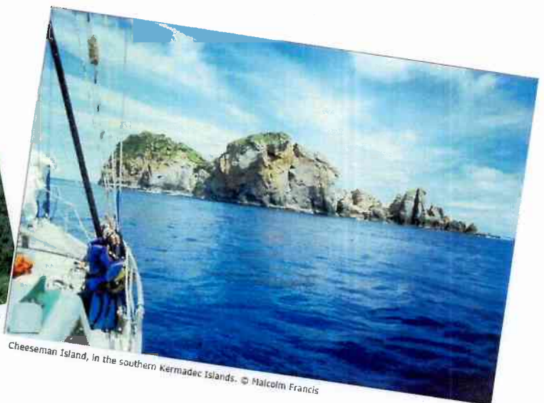
Cheeseman Island, in the southern Kermadec Islands. © Malcolm Francis